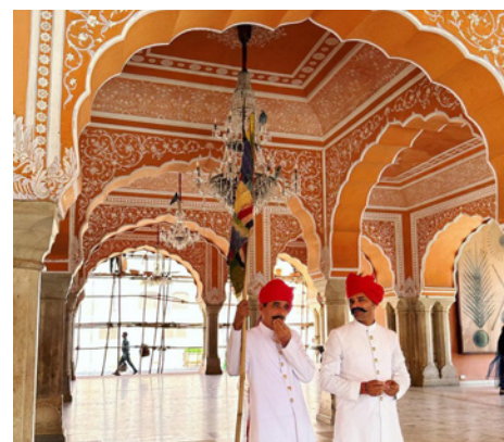
From left: Courtesy Oberoi Hotels; Courtesy Indagare