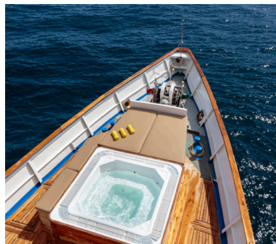
From left: Courtesy Indagare; Courtesy of Quasar Expeditions